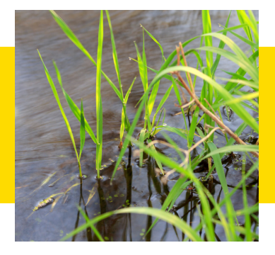
Submerged Aquatic Vegetation